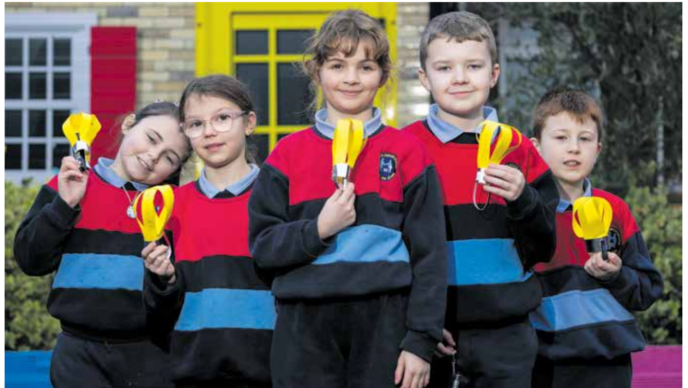
Pictured are students from St Mark's Junior National School in Tallaght relaunching the An Taisce Green-Schools energy theme for primary and secondary schools around the country.

To find out how your school can take part, visit www.greenschoolsireland.org