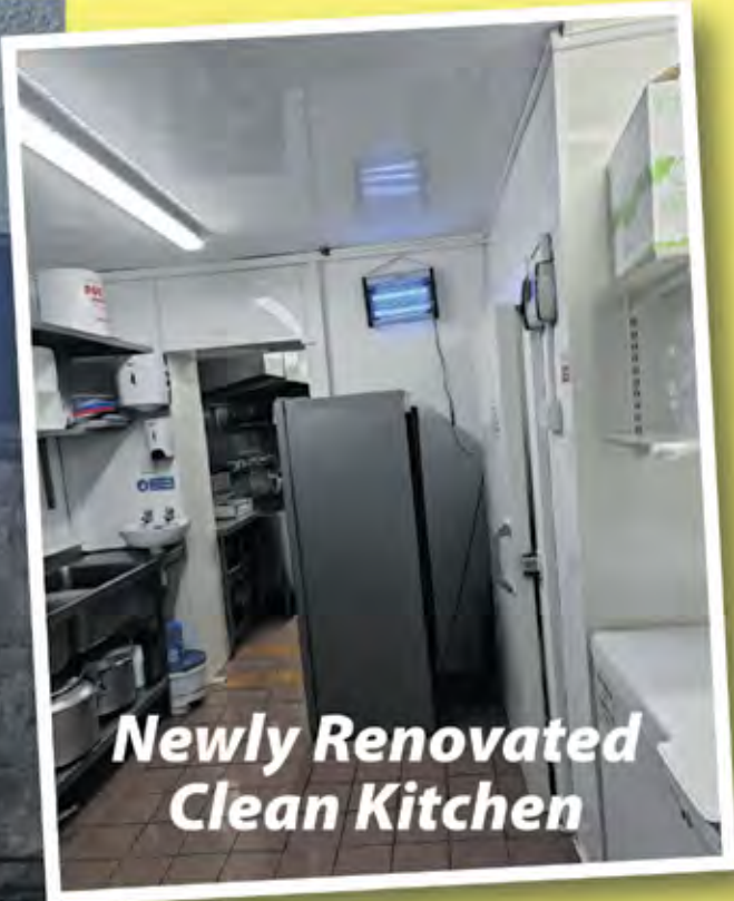
Newly Renovated Clean Kitchen