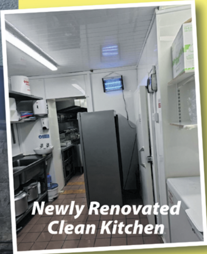
Newly Renovated Clean Kitchen