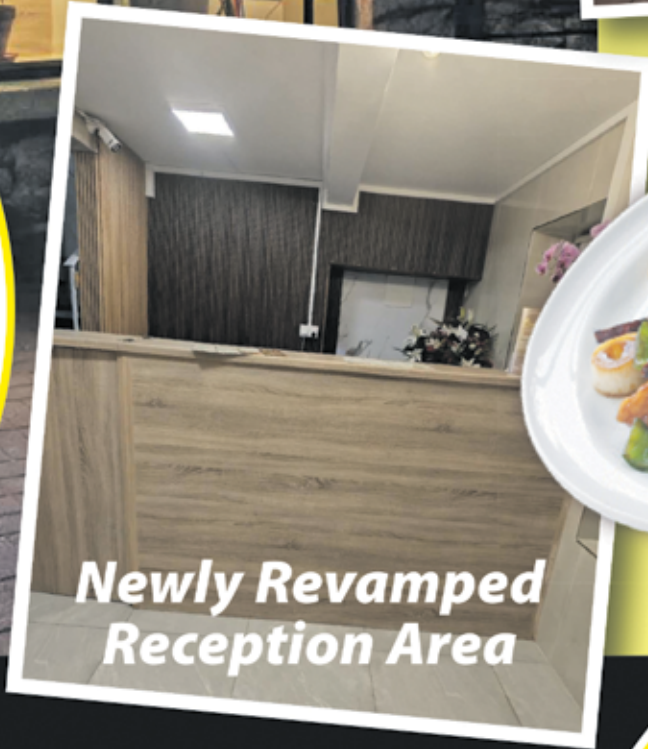
Newly Revamped Reception Area