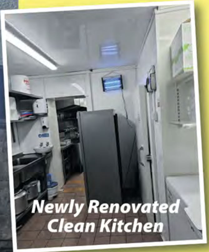
Newly Renovated Clean Kitchen