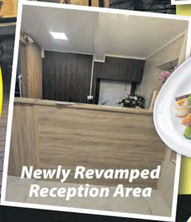
Newly Revamped Reception Area