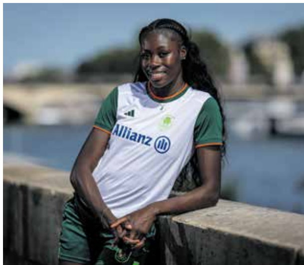
Pictured is Olympian and Allianz ambassador, Rhasidat Adeleke after making history at the Olympic Games Paris 2024. At her first Olympic Games, Rhasidat became the first Irish woman to reach an Olympic sprint final. Allianz are proud to be global and local partners of the Olympic movement, announcing the renewal of their partnership with the Olympic Federation of Ireland last month, reaffirming their commitment to supporting Irish athletes on their journey beyond Paris 2024.