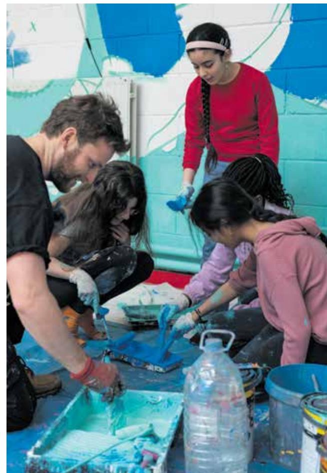
Pictured Students from St. Bernadette's National School, Clondalkin.

another school year full of thinking, discovery and most importantly fun".