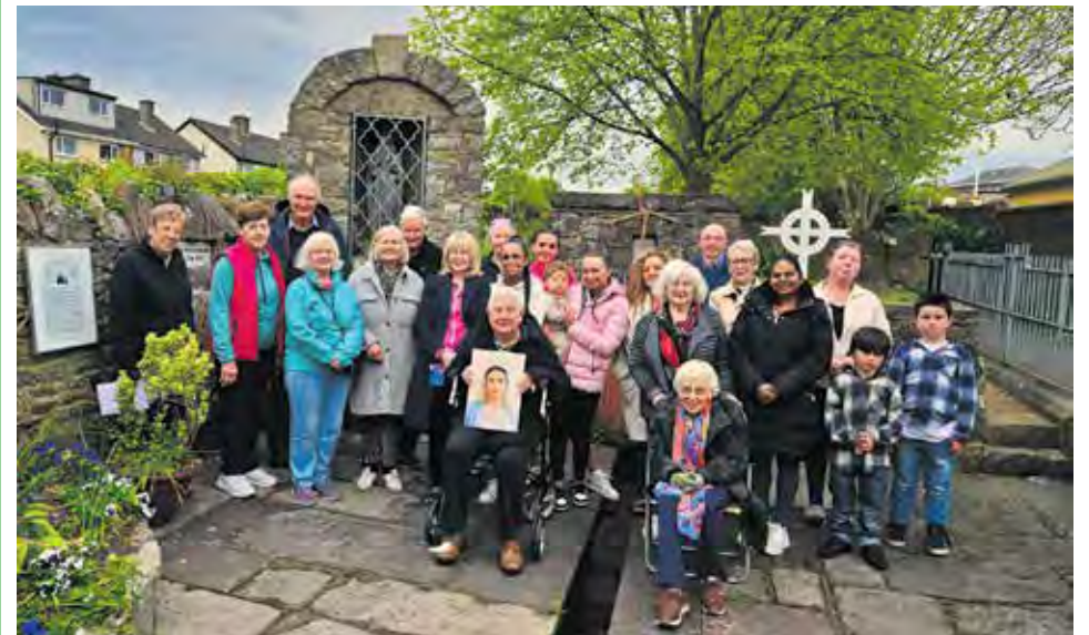
Rosary Group from the Clondalkin Parish Church of the Immaculate Conception, who attended St Brigid's Well on Boot Road every evening at 7.00pm during the month of May to recite the rosary.