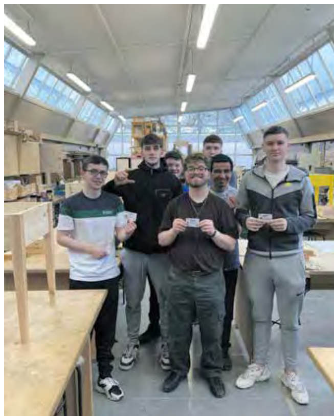
Pictured Students from Inchicore College of Further Education at SAFEPASS training with Construction Industry Federation