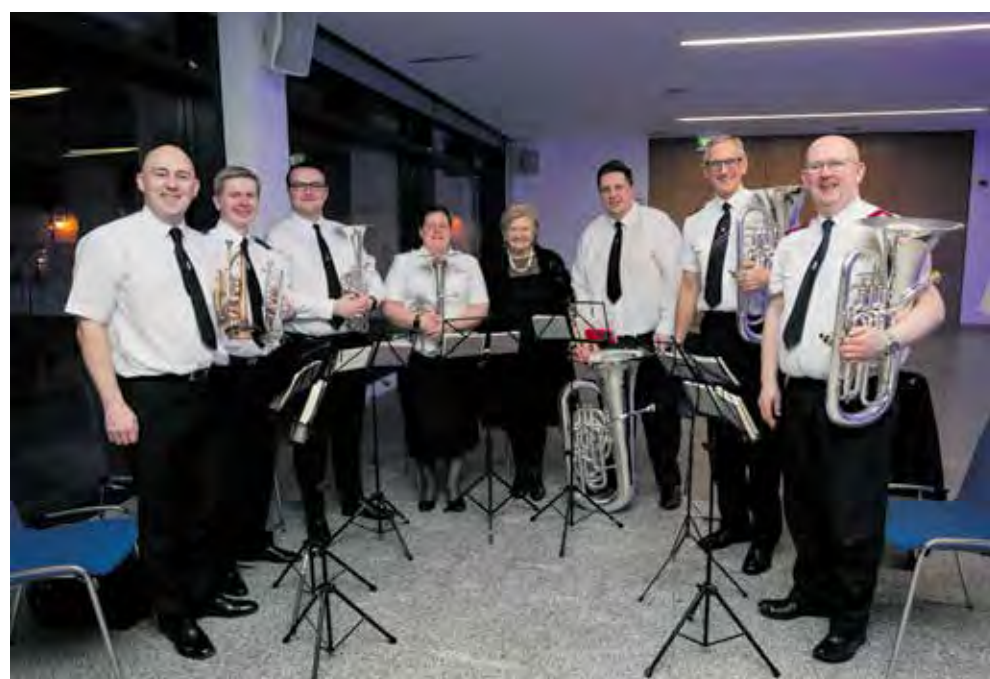
The Salvation Army brass band at the Dublin Castle fundraiser in aid of its Granby Lifehouse.