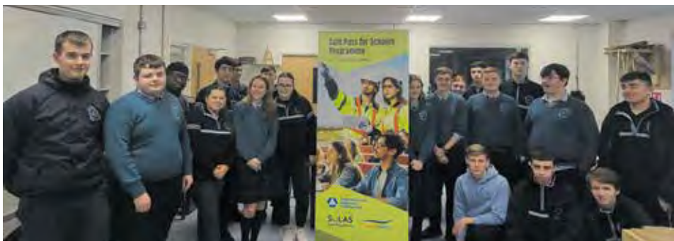
Pictured Transition year and senior cycle students from Griffeen Community College, Lucan pictured taking part in the Construction Industry Federation's Safe Pass training, recently.