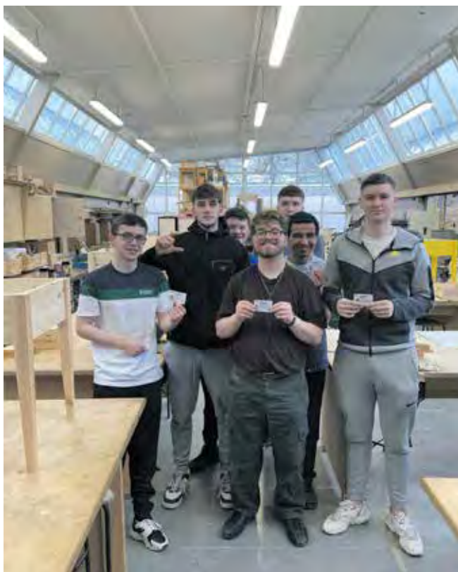
Pictured Students from Inchicore College of Further Education at SAFEPASS training with Construction Industry Federation