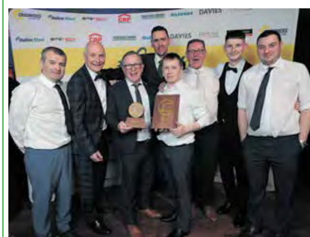
Chadwicks Group, Ireland’s leading builders’ merchants, announces the winners of its second annual Chadwicks Appreciation and Recognition Awards (CARAs). The CARAs celebrate and recognise excellence across Chadwicks Group nationwide from best-in-class customer service to colleagues who are making a positive contribution to their local community. The Chadwicks Lucan team was named Branch of the Year for their exceptional performance across the board.