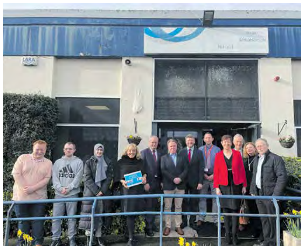
Pictured Members of Oireachtas Joint Committee on Disability Matters visit students and staff of National Learning Network Ballyfermot centre on the 14th of February.

those who need it most." National Learning Network has multiple locations across Dublin, including Tallaght, Stillorgan, Swords, Phibsboro, Mulhuddart, Ballyfermot, and the city centre.