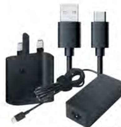
Adapters & Cables