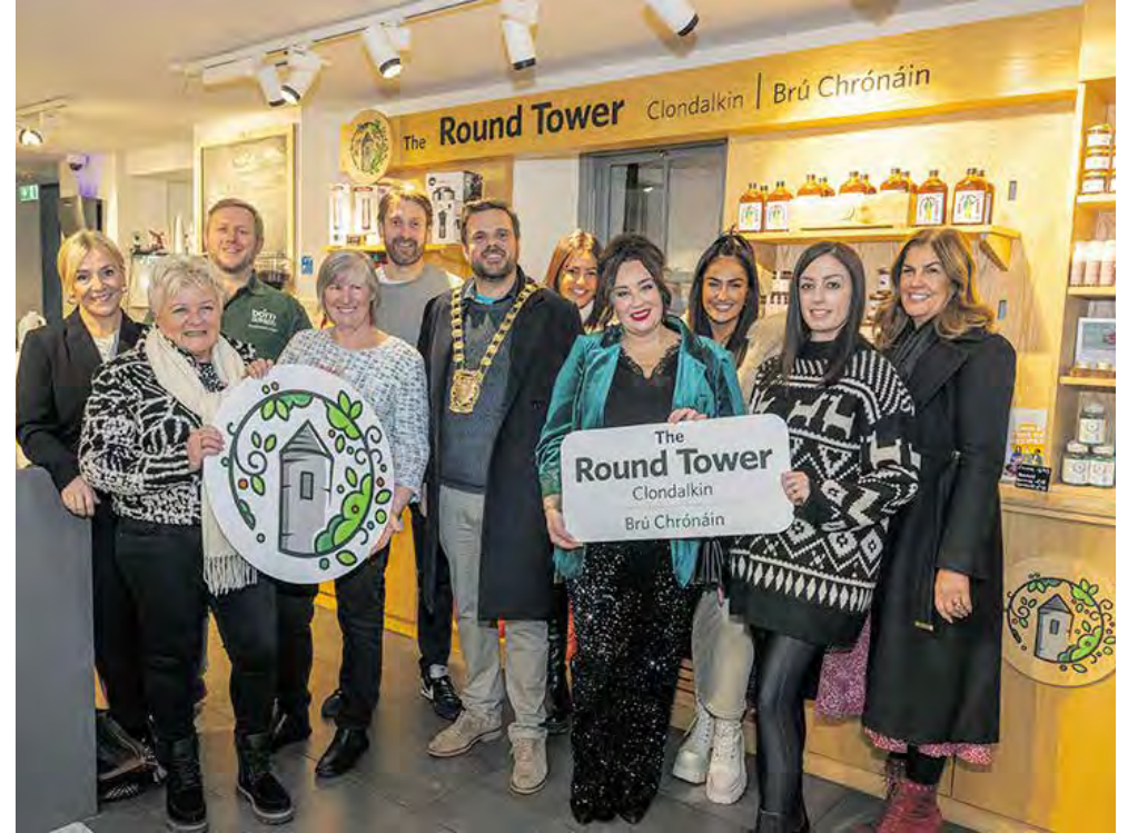
Pictured: South Dublin County Council Mayor Alan Edge and Local Suppliers

The Round Tower Design and Craft Shop will open Monday-Sunday from 9am-4pm.