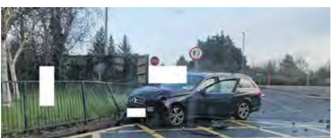
Pictured: Car incident at the N7 and Boot Road junction on Sunday 10th December.

"Luckily, no one was injured. What makes it more frustrating is the numerous times I have contacted TII who put a traffic management plan in place, which was simply a few orange plastic barriers and some signage - not good enough, as witnessed on a Sunday recently. Residents are distraught. I've lost track of the times I've contacted the TII about this. At this point, anyone near this junction is taking their lives into their own hands, that goes for both pedestrians and motorists. Continuous car accidents at this location add to residents' fear and anxiety. TII need a proactive approach here, rather than a reactive approach."