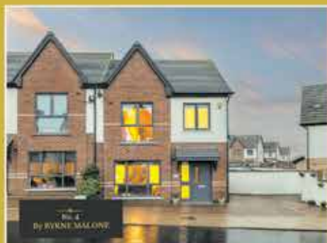
4 Elder Heath Crescent, Tallaght Asking price €425,000