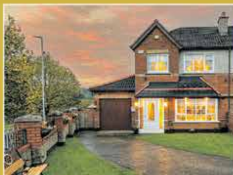
40 Ellensborough Copse, Tallaght Asking price €435,000