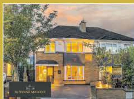
10 Parklands Avenue, Ballycullen Asking price €495,000