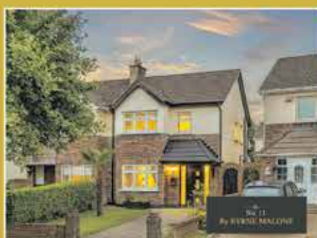
11 Verschoyle Park, Citywest Asking price €365,000