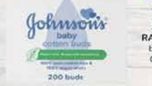
JOHNSON'S Pure Cotton Buds 200's