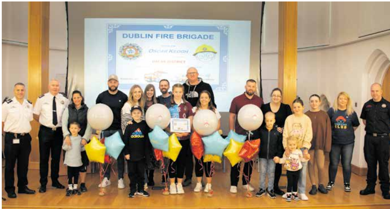
Dublin Fire Brigade (DFB) has launched a new partnership with a wonderful childhood cancer charity called 'Oscar's Kids'. For more information on the 'Oscar's Kids' charity visit www.oscarskids.ie