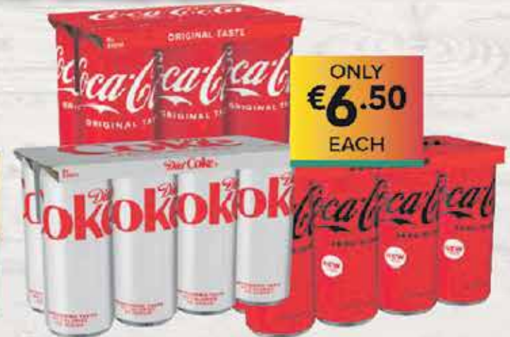
COCA-COLA Regular Cans 6 Pack 6x330ml / Zero / Diet 8 pack 8x330ml €3.28 Per lit