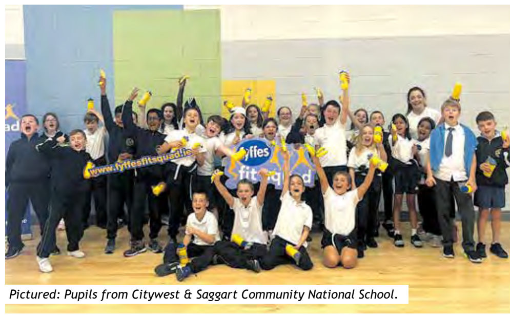
Pictured: Pupils from Citywest & Saggart Community National School.

find details online at www.fyffesfitsquad.ie