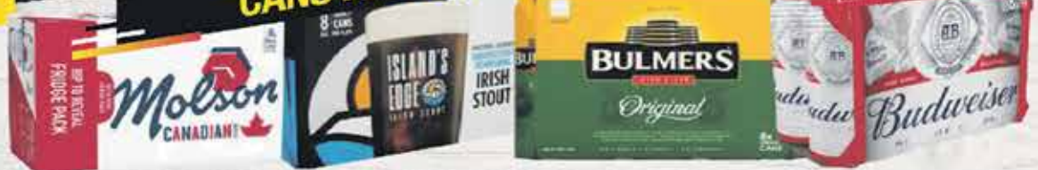
CANADIAN €12.75 / ISLAND'S EDGE €14.65 / BULMERS / BULMERS LIGHT €14.95 / BUDWEISER €14.95 See instore for details