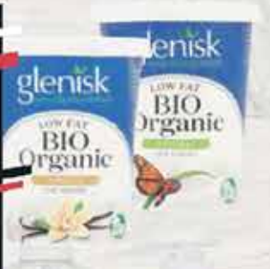
GLENISK Organic Low Fat Yogurt Pots Range 500g / 450g See instore for details