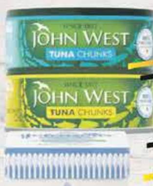
JOHN WEST Tuna Chunks in Brine / Oil 145g