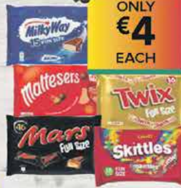
MARS / MALTESERS / MILKY WAY / TWIX / SKITTLES Funsize Multipack 215g-324g €18.60 Per kg