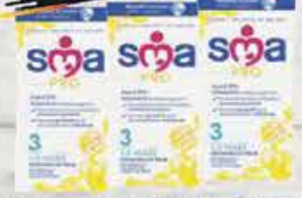
SMA Pro Growing Up Milk 1-3yr 200ml €5 Per lit