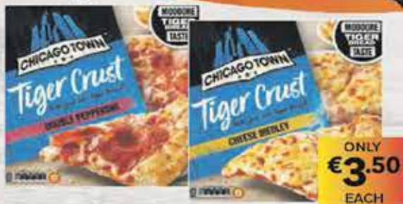
CHICAGO TOWN Tiger Crust Pizza Thin Cheese / Double Pepperoni 350g-355g See shelf for information