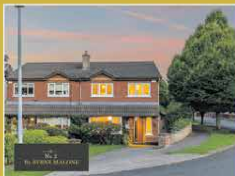
2 Corbally Drive, Citywest Asking price €435,000