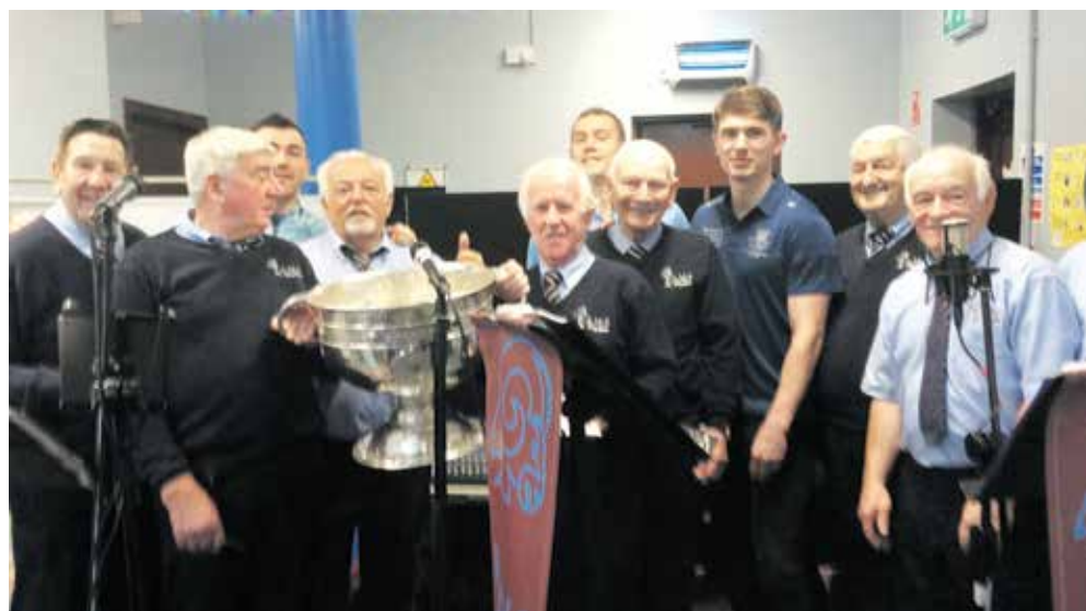
The Newcastle group RAMS in Rhythm recently visited and entertained at the Capuchin Fathers Day Centre, Bow Street.