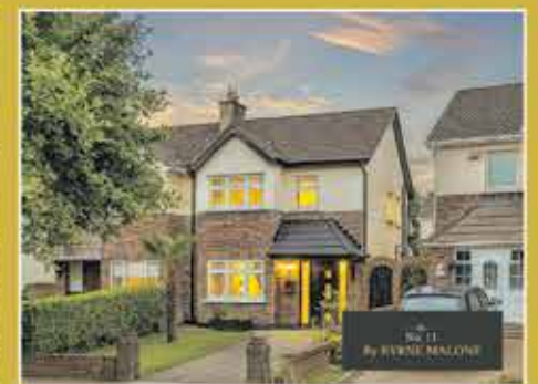
11 Verschoyle Park, Citywest Asking price €365,000