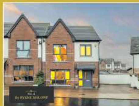
4 Elder Heath Crescent, Tallaght Asking price €425,000