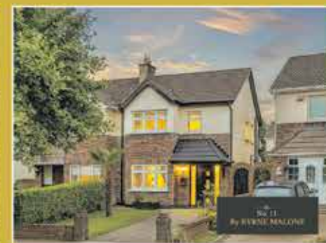
11 Verschoyle Park, Citywest Asking price €365,000