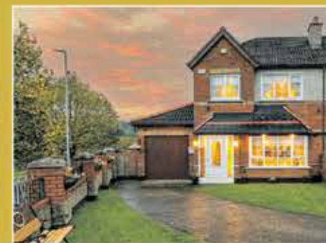
40 Ellensborough Copse, Tallaght Asking price €435,000