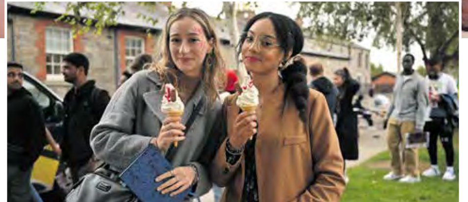
Students enjoying induction day at Griffith College's Dublin campus on the South Circular Road. Griffith College is home to more than 7,000 learners across its campuses in Dublin, Cork and Limerick.