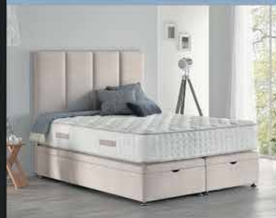
Pearl Pocket 1250 with Respa full opening storage base & standard headboard ONLY €1499 (Double) all sizes available