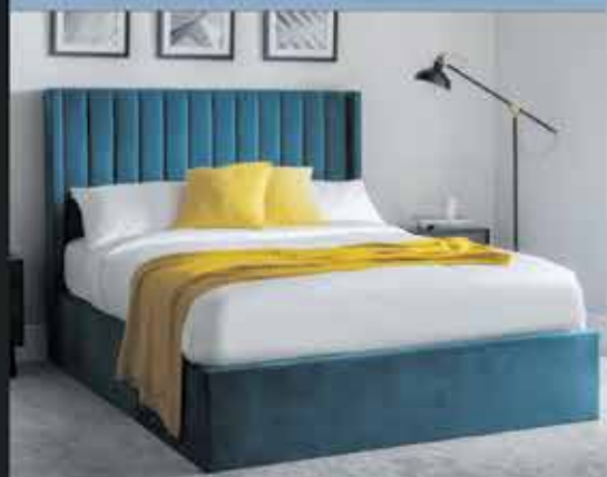
Arlise Bedframe Full opening storage bed ONLY €1099 (Double) all sizes available