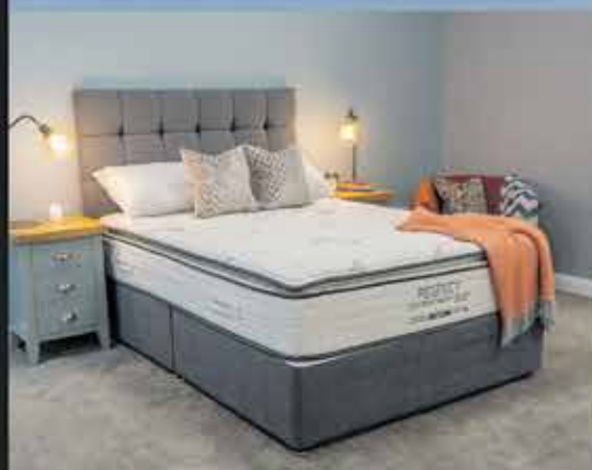
Annalee Bed Set Headboard, Base & Mattress ONLY €869 (Double) all sizes available