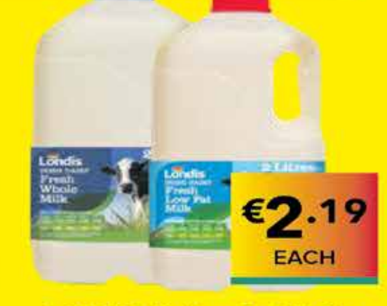
LONDIS Milk / Low Fat Milk 2lt €1.25 per It