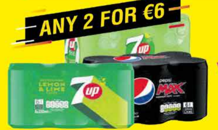
7UP Free / Regular PEPSI MAX Cans 6 Pack x 330ml See instore for details