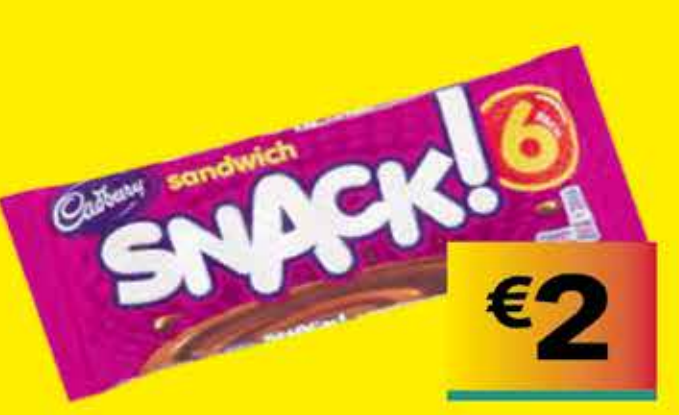
CADBURY Snack Sandwich 6 Pack 132g €15.15 per kg