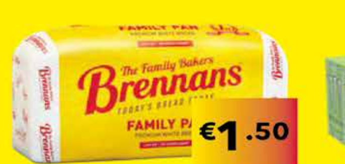
BRENNAN'S Sliced Bread 800g €274 per kg