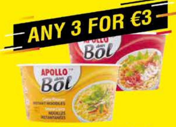
APOLLO Noodles range 85g €19.29 per kg