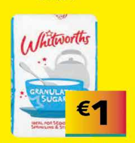
WHITWORTHS Sugar 1kg €1.50 per kg

ARIEL Colour All-in-1 Pods WL Caps / BOLD All-in-1 Pods Lav & Camomile / FAIRY Non Bio Pods for Sensitive Skin 13 Wash / DAZ All-in-1 Pods 12 Wash See instore for details