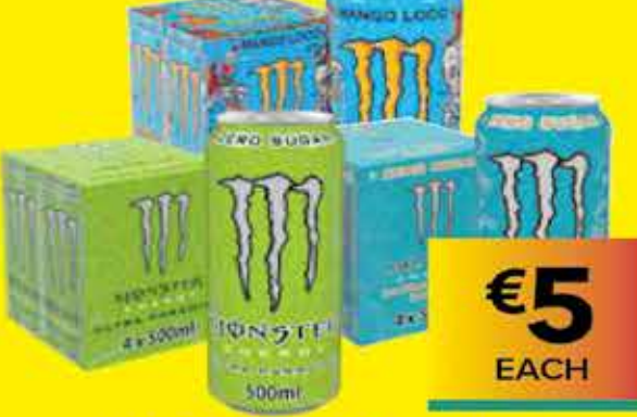
MONSTER Range 4 x 500ml ©14 per litre